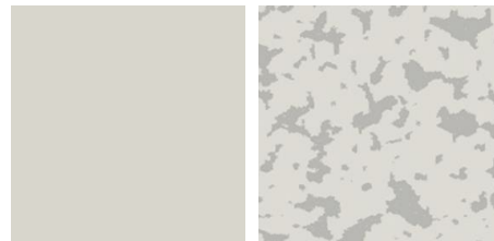
Pastel Grey T30.0.1